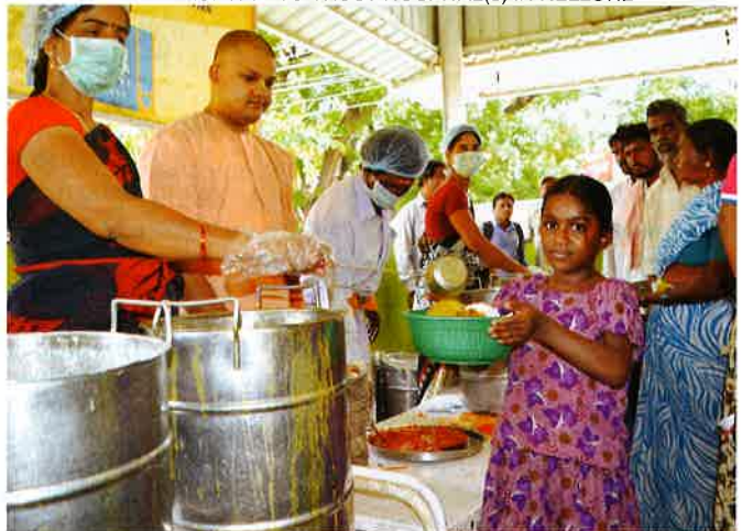
PROVIDED FREE MEALS TO INPATIENT ATTENDANTS AND POOR PEOPLE AT GOVERNMENT HOSPITAL.