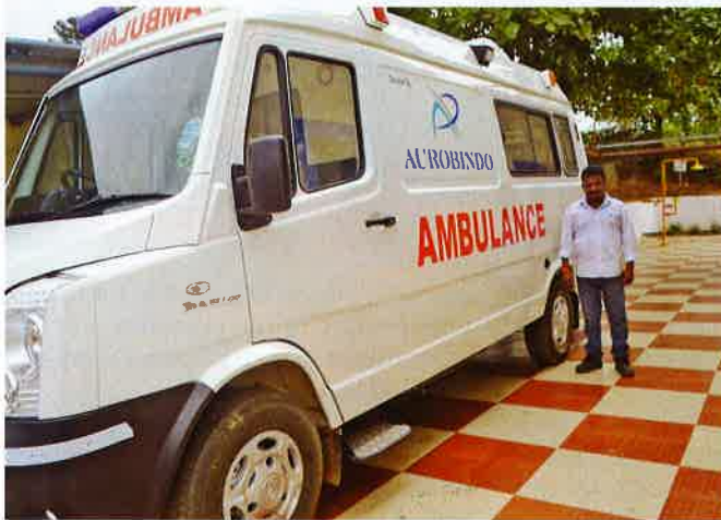
PROMOTING HEALTH FOR UNDERPRIVILEGED PEOPLE PROVIDED AIR CONDITIONED AMBULANCE.

In today's age, it is no longer optional for any corporate to be a responsible player in the society. Having an established Corporate Social Responsibility (CSR) strategy is critical to a company's competitiveness. Such a strategy should comprise procedures and policies that integrate environmental, social, consumer or ethical concerns into a corporate's operations.