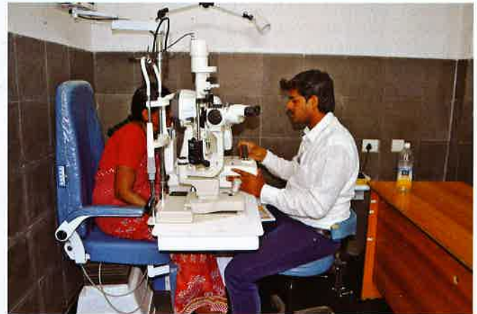
PROVIDING EYE CARE TREATMENT FOR SENIOR CITIZENS AND POOR PEOPLE PROVIDED EYE CARE EQUIPMENTS.

According to the company, "CSR means responsible business practices through