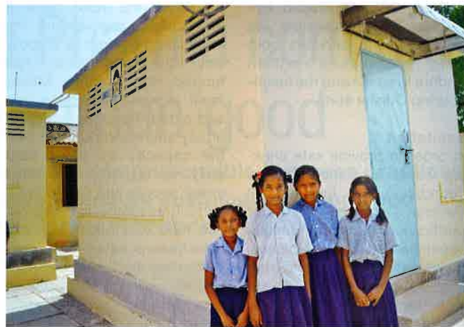
CONSTRUCTED NEW TOILETS FOR GIRLS & BOYS IN MANY GOVERNMENT SCHOOLS.

The Aurobindo Pharma Foundation has adopted Mahatma Gandhi's ideology according to which "If the village perishes, India will perish too." The Foundation is, therefore, striving to