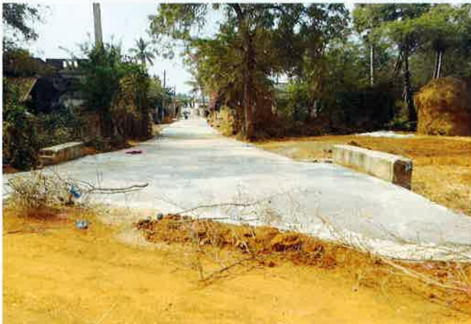
LAI D ROADS IN MANY VILLAGES.

By undertaking the construction of individual household latrines, the Foundation is providing sanitation, and at the same time helping in improving health outcomes of adolescent girls and lactating mothers.