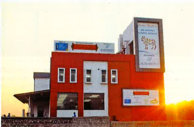
BUILDING OF FULLY AUTOMATED KITCHEN ( UNDER PRIVILEGED AND GOVT. SCHOOLS)