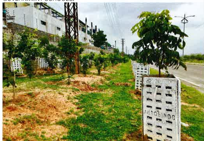
PROVIDED PLANTS AND TREE GUARDS IN MANY VILLAGES