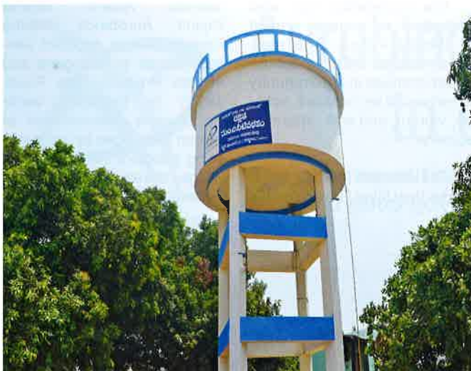
CONSTRUCTED WATER TANKS FOR DRINKING WATER PURPOSE IN MANY VILLAGES.