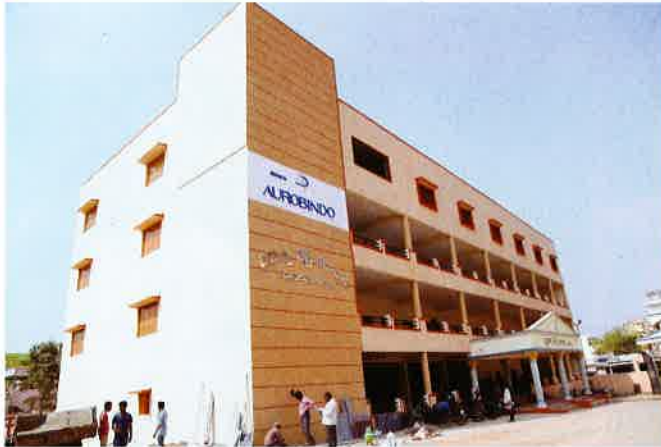
PROMOTION OF EDUCATION, CONSTRUCTED GOVERNMENT DEGREE COLLEGE

The pharmaceutical major adopts responsible business practices and good governance to ensure sustainable change and development of society