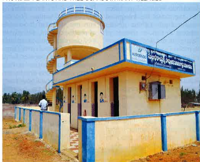
CONSTRUCTED PUBLIC AND INDIVIDUAL TOILETS FOR MEN & WOMEN.

make villages a model for the entire country by leveraging technology to improve human development, sustainability, and connectivity.