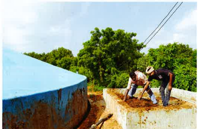
TOWARD ANIMAL WELFARE, CONSTRUCTED BIO-METHANATION-CUM-ELECTRICITY GENERATION PLANT AT GOSHALA

'Sansad Adarsh Grama Yojana', Aurobindo Pharma Foundation has adopted several villages in Telangana and Andhra Pradesh. The Foundation is tirelessly working towards improvement of human resources by strengthening people's institutions like village development committee and self-help groups.