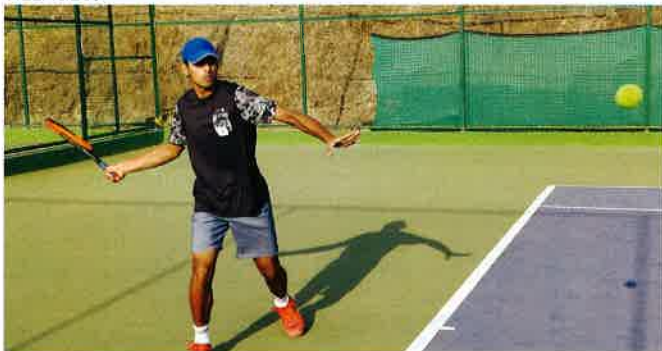
PROVIDED FUNDS TO MANY RURAL SPORTS MEN & WOMEN.