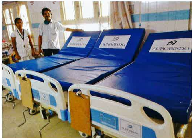
COMPLETE BED FACILITY TO TRUST HOSPITAL(S) IN NELLORE